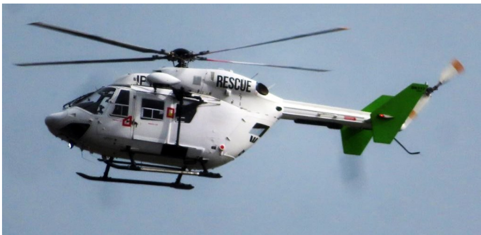
Search & Rescue Services Kawasaki BK117 B-2 ZK-IPT overhead Paraparaumu