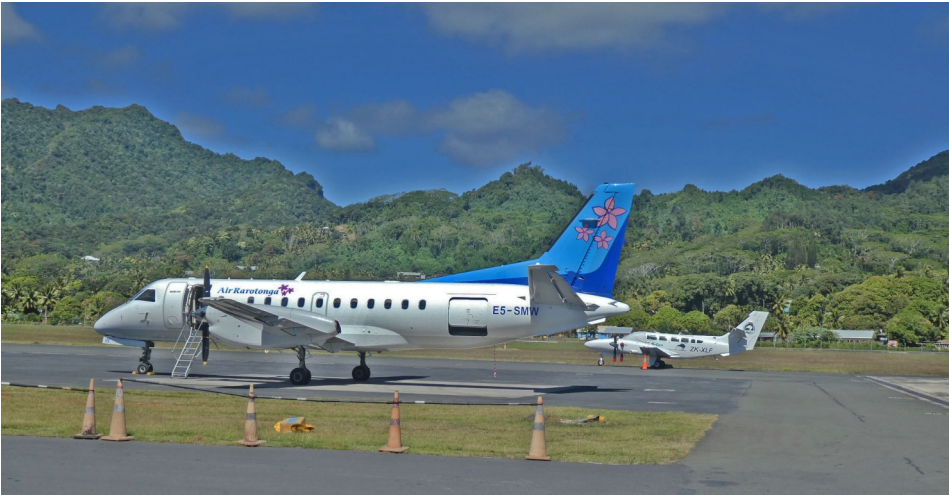
Air Rarotonga Saab 340B E5-SMW at Avarua Airport.